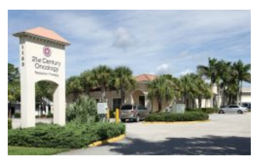
Fla. Health Clinic's Cyber Insurer to Pay $2.3M HIPAA Settlement