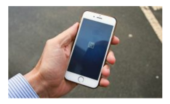
10 Cybersecurity Travel Tips For The Holidays